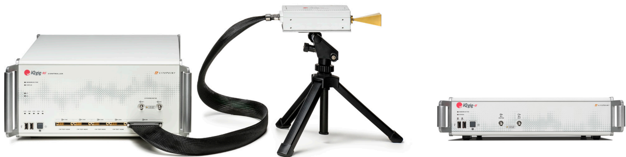
IQgig-RF Test System 1

IQgig-RF is available in two configurations: single-DUT and dual-DUT. The single-DUT IQgig-RF test system includes one vector test head to perform all 802.11ad physical layer test items. In addition, it can be configured with up to 4 CW test heads for flexible and rapid power measurements. The dual-DUT IQgig-RF is ideal for deploying in volume production, as two vector test heads are independently and simultaneously controlled to allow true parallel testing to maximize throughput. IQgig-IF is a compact test system which supports the same WiGig measurements as the IQgig-RF, but uses conducted testing in the baseband module frequency bands. It is designed for 4.9 to 19.4 GHz, covering the wide ranges of major chipset companies' proprietary IF frequency ranges. By sharing the same test platform—an intuitive GUI and automated test solution—IQgig-RF and IQgig-IF are complementary WiGig test solutions that provide a simple data correlation and ensure high quality in all of your WiGig testing needs.