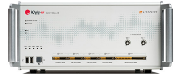
IQgig-RF Test System