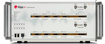
IQgig-RF Dual-DUT Test System