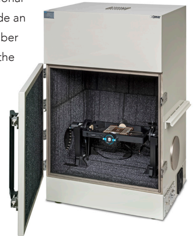
28 GHz/39 GHz OTA Beamforming Test Chamber

LitePoint's 5G mmWave optional test fixturing solutions include an OTA (over-the-air) test chamber for testing beamforming of the DUT's mmWave antenna structures.