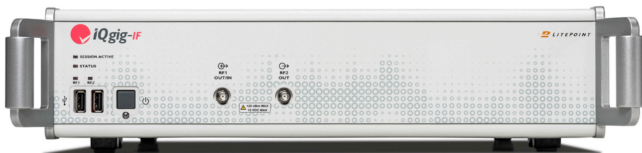
IQgig-IF Front Panel